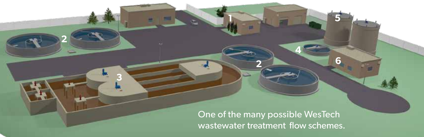
One of the many possible WesTech wastewater treatment flow schemes.

With growing demand for high-quality effluent and the reuse of treated wastewater, WesTech has your solution. WesTech offers a full range of tertiary treatment equipment for new construction, plant upgrades, and in-basin retrofits.